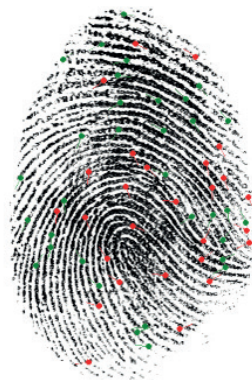
Image depicting what an ievo reader scans and key minutiae features.